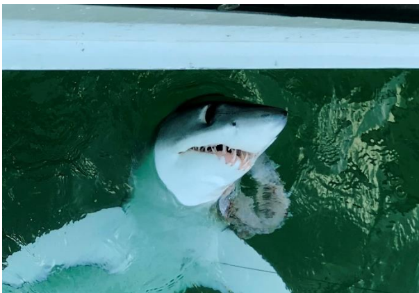
.....and Smiling for the camera.

The 50 was next to purr off, as I tightened up a blue missile of a Mako shot out of the sea. We cheered uncontrollably as Willy slapped my