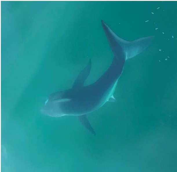
Mako circling boat

As we excitedly talked about the Thresher, a Mako shot through our slick, its head moving quickly side to side as it hunted the cause of the smell source. I picked up the pitcher rod and shot the bait in its path. Wham! That Mako smashed the bait and ran off at high speed. Here I was into my second Mako! After a great scrap we measured and released a beautiful female that worked out at 151 pounds. More jumping about ensued!