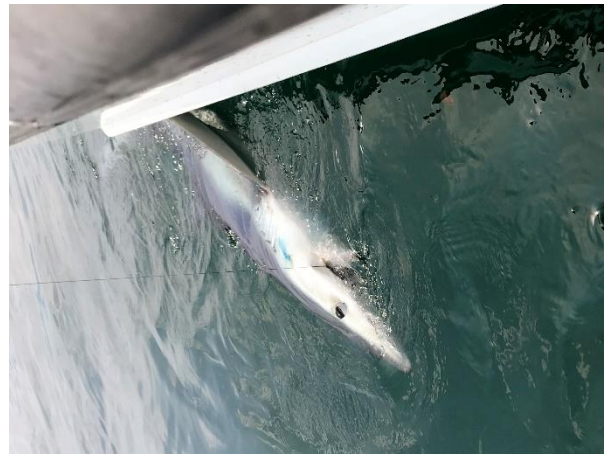
200lb plus Blue

Within 5 minutes of rebaiting I was in to the next shark, a nice 8 foot Blue of 130 pounds. 'That's a nice Blue' I claimed, but Willy and Ben said it wasn't that big for these waters and I would catch much bigger than that today. What a place! As we released the so called 'tiddler', the shallow reel shot off. I reeled in like a maniac and secured the hook up, as I did this a big dorsal fin and tail broke the surface and I could hardly believe my eyes, Mako! This was my big chance, concentrate and don't screw up I said to myself. I took in its every detail as it twisted just under the surface and snapped its jaws in the crystal clear water. I was spellbound and loving every second. With just one flick of its tail it would shoot off 50 meters! I wanted to measure and admire this beautiful fish in the boat, so we carefully boated it through the gate. This Male Mako's skin was almost reflective; it was the perfect killer, a torpedo built for pure speed. Measurements were taken to the fork and girth and the weight was estimated at 202lbs. As the fish swam away the three of us jumped around like mad men, we were ecstatic!